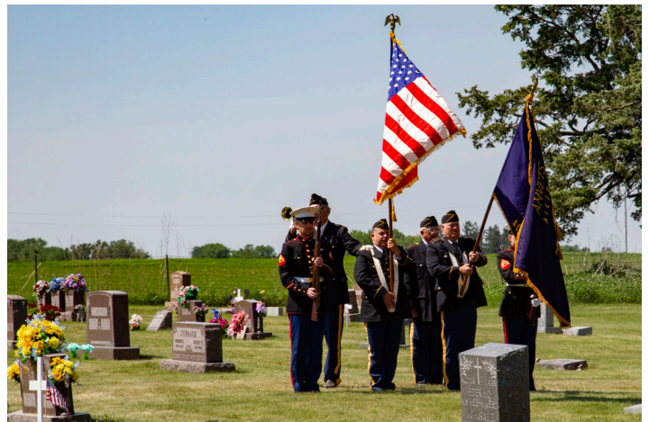
On Monday, May 28 the Allison AMVETS Post #88 Drill Team held a brief Memorial Day Ceremony at the South Vilmar Cemetery.