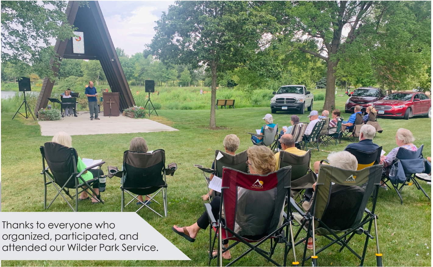
Thanks to everyone who organized, participated, and attended our Wilder Park Service.