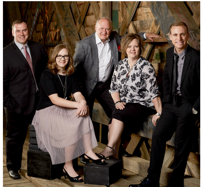
The Williamson's Family Gospel Group